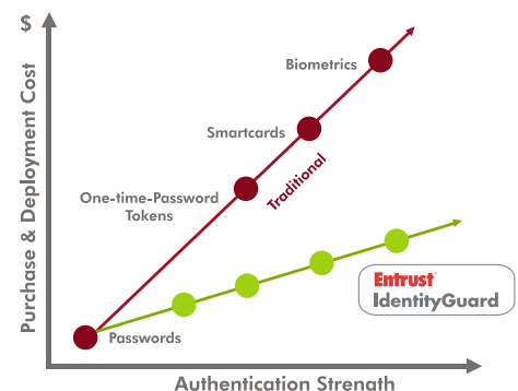
Figure 1: The Authentication Challenge